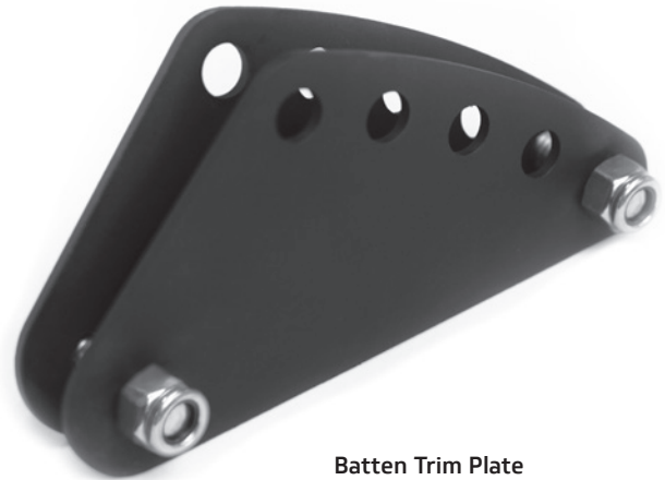
Batten Trim Plate